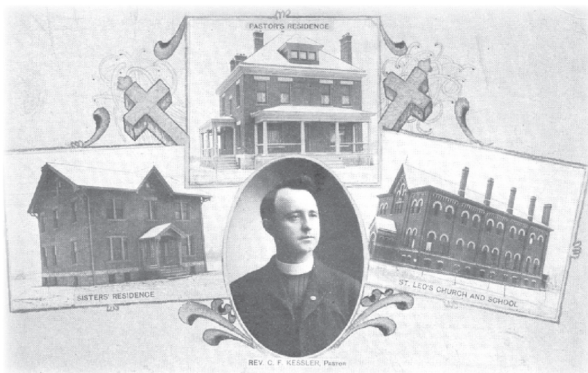
St. Leo Church Postcard