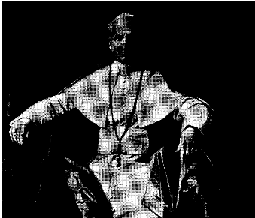
Pope Leo XIII (1810-1903)

Author of Rerum Novarum , with the help of Cardinal Francesco Zigliara and the help and influence of Cardinals Mermillod of Switzerland, Gibbons of the United States, and Manning of England and Archbishop Walsh of Dublin.