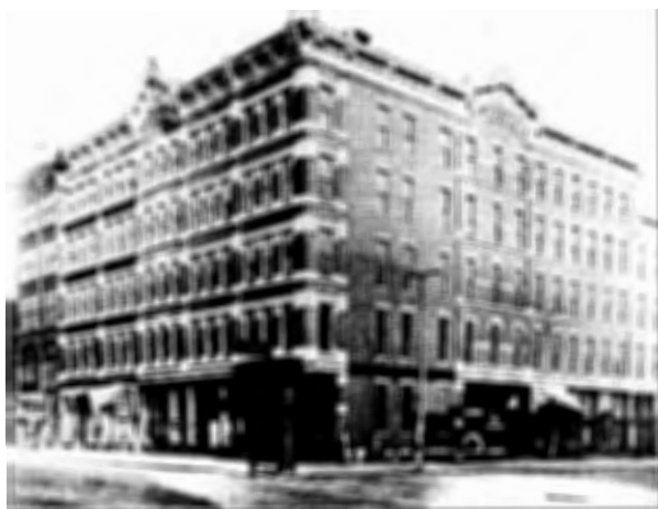
The Clinton Building

The call for the successful national union convention was made at a convention of John Kane's Indiana district of the National Progressive Union in December of 1889. Kane was one of the three N.P.U. representatives who met with K of L counterparts to arrange for the unity convention. When the full delegations of the two unions met in the Columbus City Hall (on the present site of the Ohio Theatre), on January 22 through 25, 1890, Kane played another important part. A resolution to unite was passed on January 23 but, as reported in the Columbus Dispatch , "the prospects for a permanent amalgamation" hinged on agreement to the "all-important" constitution for the new organization. Kane was one of the six members of the constitution committee, who worked from 8 p.m. on January 23 until 3 a.m. the next morning to hammer out a proposal. After heated discussion, the constitution was adopted by the convention on January 25. On the same day, in one of its last acts, the convention elected John Kane to membership on the first executive board of the United Mine Workers of America. (6)